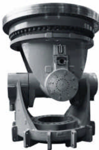
figure 3: steel castings for offshore structures universal joint for a oil production ship