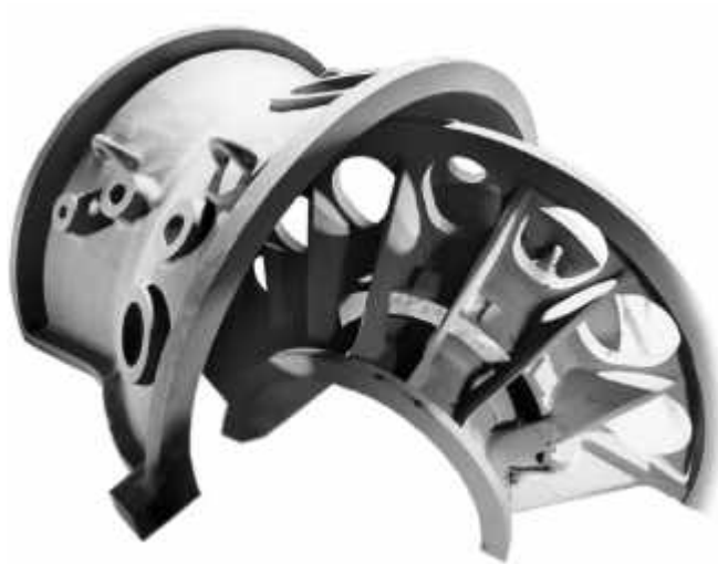
figure 2: gasturbine components, made of creep resistant cast steel replaced a former welding fabrication