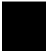
figure 5: CIATF, Commission 7.2 - participants