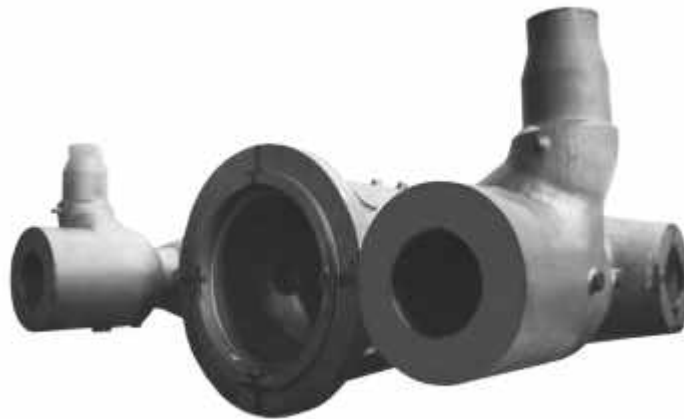
figure 4 steel casting for steam turbine processes made of 9-10% Cr cast steel