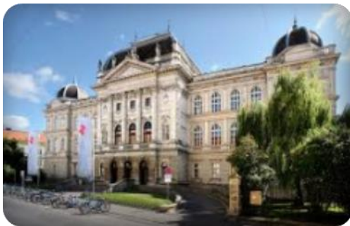
Technical University of Graz

The workshop will bring together experts from leading operators, manufacturers and suppliers as well as IoT companies together with related stakeholders to discuss challenges and opportunities for the operation of hydro power fleets accruing from digital transformation.