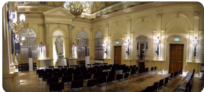
Aula of the Technical University of Graz

Based on practical innovative digital measures the participants will gain insights on how digital solutions are already successfully implemented and applied. As a valuable complement to the lectures, all participants are invited to visit the Hydraulic Laboratory from the Institute of Hydraulic Engineering and Water Management at the Technical University of Graz.